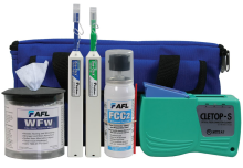
FCP2 Fiber Cleaning Kit for SC/ST/FC/LC