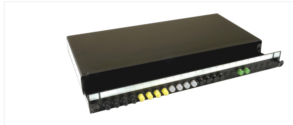
G 360° view available for this product - visit the product page online to find out more

This innovative, robust 1U sliding patch panel. This panel has been designed to accept up to 24 fibres housed within a 1U space.