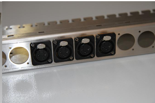
Front showing adapters (not included)